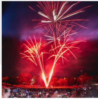
Heathridge Carols 15,000+