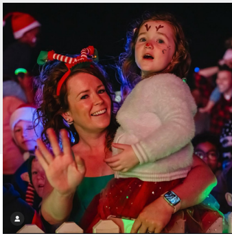
Yanchep Carols 7000+

The continued growth of all of our carols events is a testament to how loved these events are by every one who comes. This is only possible with the dedication of a team of over 200 volunteers at our three Carols events who give their time, energy and expertise to serve the community.