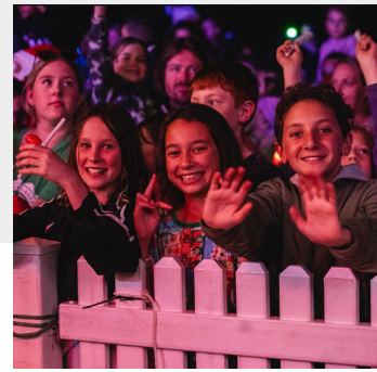
City Carols 10,000+